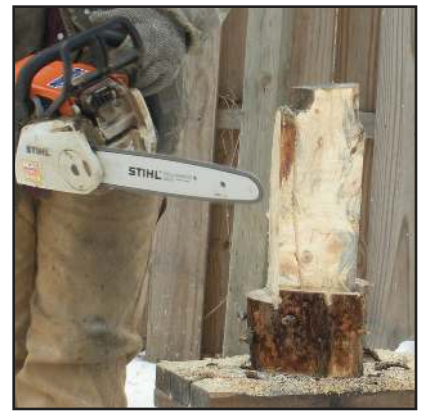
1. block out