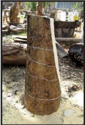
1. Taper from center to eight inches up from the bottom.