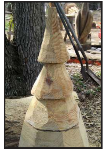
6. Taper each level all around.