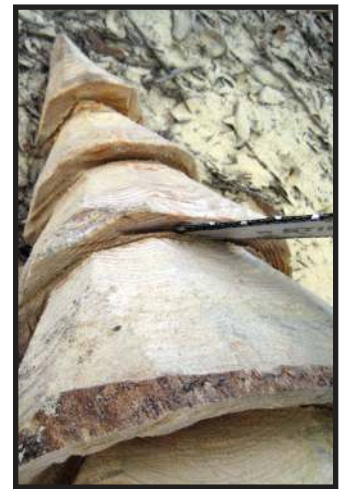
5. Taper undersides of levels.