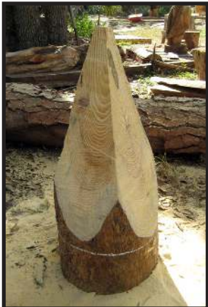
2. Taper four sides,