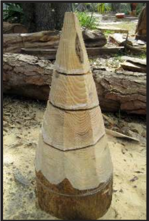
4. Make a SHALLOW "stop cut" for each level. (1.5" to 2" max.)