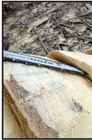
5. Undercut each level four inches.