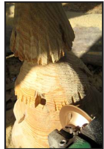
5. Use saw or grinder to "fir" the levels.