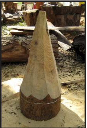
3. Taper four the four corners.