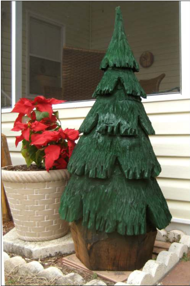
This carving pattern shows 5 levels of "branches" but looks just very cute with three, four or five levels of "branches". Making a tapered hexagon base makes it look like a "potted" tree.