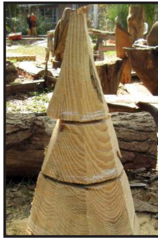
5. Taper each level up to the stop cut.